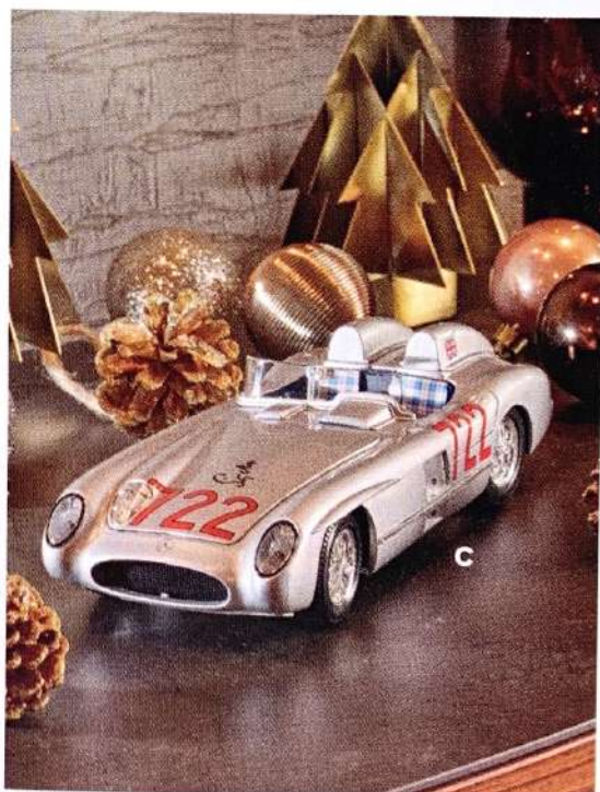
A. Velasor vintage slot cars, from £420 | B. The Ferrari Grand Prix Polaroid Collection, 22 exclusive prints £1,500 C. Mercedes '722' boxed 1:18-scale model, signed by Sir Stirling Moss £199